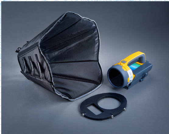
Bactiscan™ shown with optional shroud

Food manufacturers often face challenges in detecting bacteria and biofilms that could contaminate their products. Currently, they rely on ATP tests, which measure the presence of actively growing microorganisms by detecting adenosine triphosphate (ATP). While this method is effective, it has limitations due to the small size of the swabbed area relative to the overall surface. The swabbing process itself can be cumbersome. However, by complementing this traditional method with the Bactiscan™, ATP testing can become faster and more efficient. The Bactiscan™ helps identify areas of contamination, allowing ATP swab tests to be focused on those spots.